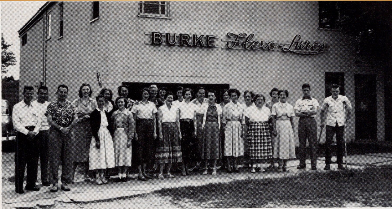
Factory and Staff of Expanded Burke Flexo-Products Co., Traverse City, Mich.