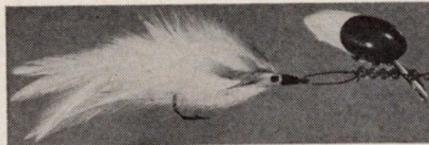
Wapsi Bill Hammon Plug With Streamer.

ly for bass, pike, pickerel, muskellunge and nearly all salt water game species.