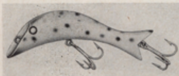
Creek Chub 1/2-Ounce Trolling Nikle.

Unusual too, is the plastic material. Two sizes have been developed for spinning, light tackle casting and trolling. Weights are one-fourth and one-half ounce, re-