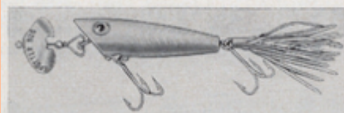
Arbogast Floating Sputterbug.

The Nikle is now available at suggested retail prices of $1.25 for the spinning size and $1.35 for the casting lure. A new colorful folder fully describing the Nikle is available on request. Creek Chub Bait Co.