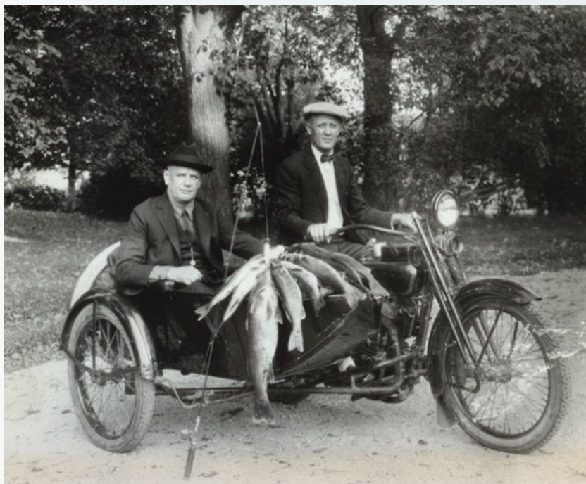
William S. Harley (right) and William A. Davidson (in sidecar, and father of Arthur Davidson) in 1924 from the AMA Motorcycle Hall of Fame

April 17 - 19 , 2015 Greenville, SC CATC Spring Show