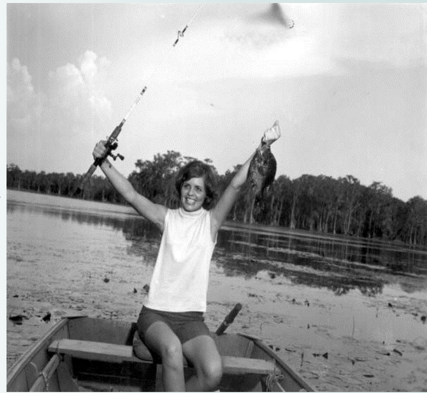
A young woman excitedly holds up her catch of fish on a Shakespeare Fishing Tackle Company sponsored trip near Panama City, Florida in 1968

January 6-7, 2012 2012 NFLCC Region 3 Winterfest Pigeon Forge, Tennessee