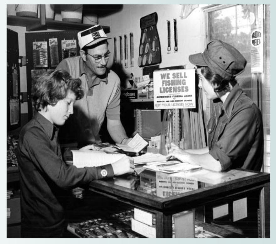
Fisherman purchases a fishing license at a bait shop

April 9-10, 2011 CATC Spring Show Southern Pines, NC